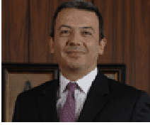
Başbuğ Y. Samancıoğlu